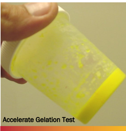
Accelerate Gelation Test